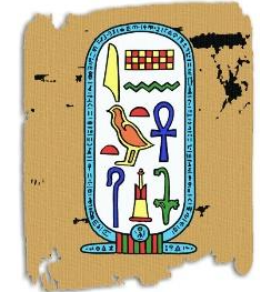
Design a cartouche