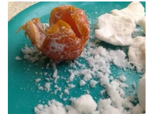
Mummification of a tomato