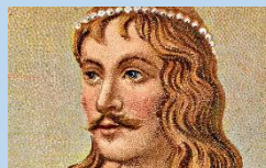
King Canute (AD 995-1035)