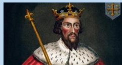
King Alfred the Great (AD 849-899)

Is it fair to say the Vikings were raiders and the Anglo-Saxons settlers?